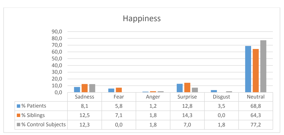
Graph 1. Mistakes in recognition of happiness.

Cognitive Remediation Journal ISSN 1805-7225